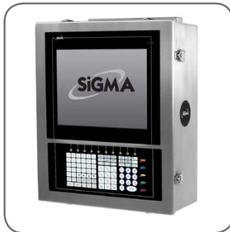
Sigma NEMA 4X Computers