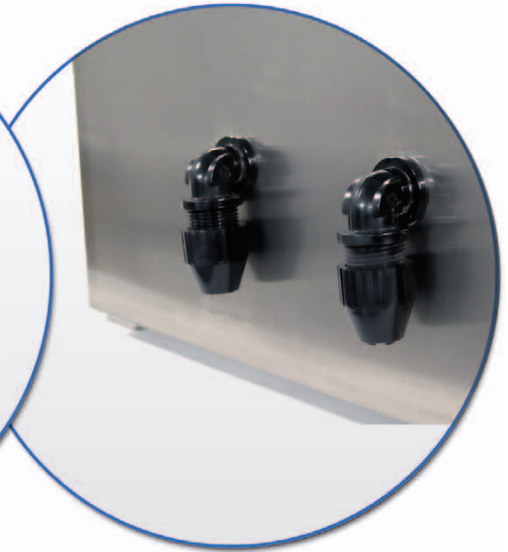
Any Connections - All Washdown, even quick disconnects.